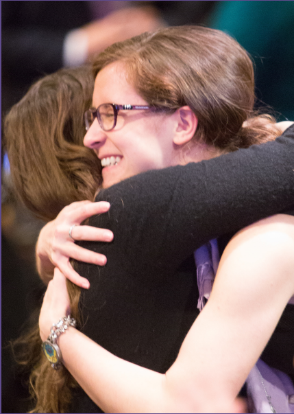
Image: Two people with brown hair embrace.

Selected as a civil society leader on the Generation Equality Forum (GEF) Feminist Movements & Leadership Action Coalition, WEI began leveraging its role to influence the Beijing+25 process to ensure that its outcomes reflect priorities for feminists with disabilities worldwide.