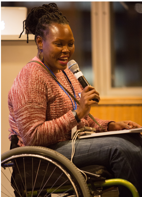
Image: A woman wearing a red sweater and jeans is sitting in her wheelchair energetically speaking into a microphone.